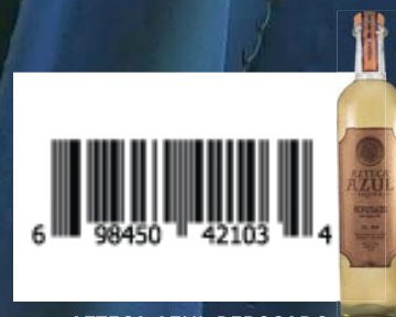
AZTECA AZUL REPOSADO 750 ml