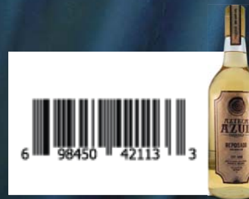
AZTECA AZUL REPOSADO 1 Lt