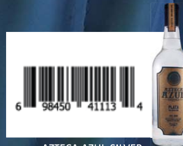
AZTECA AZUL SILVER 1 Lt